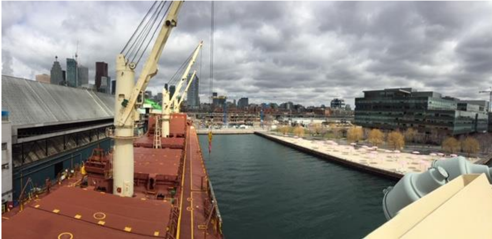
Sugar Dock and Sugar Beach, Port of Toronto